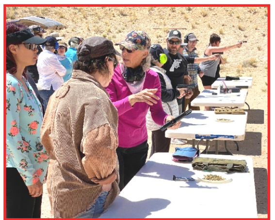
On the firing line, where it was "Safety First" at all times!