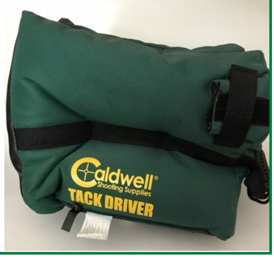
Tack Driver Shooting Bag