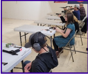
Jr. Small Bore Pistol vs. Veteran Air Pistol Team Match at Zia.